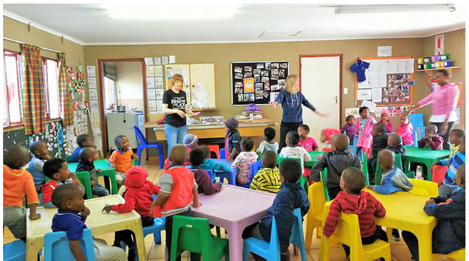
Meal a Day sponsors breakfast and lunch at the crèches.

The schools have reputations to being places where children are offered a safe and stimulating environment while parents are given an opportunity to find employment to support their families. Indoor and outdoor activities are offered by COPT volunteers on a weekly basis.