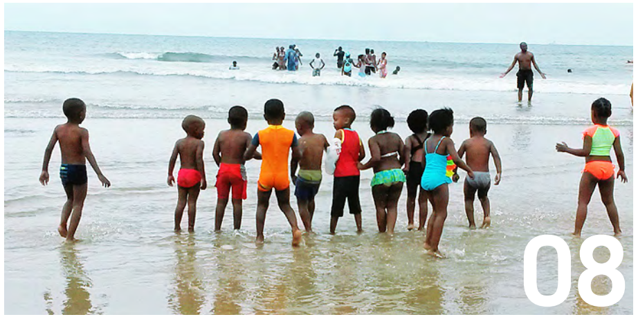
COPT organised and sponsored a number of outings for the crèches this year. The beach and a visit to Ushaka marine world was a highlight.